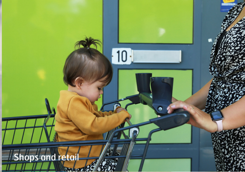
Shops and retail