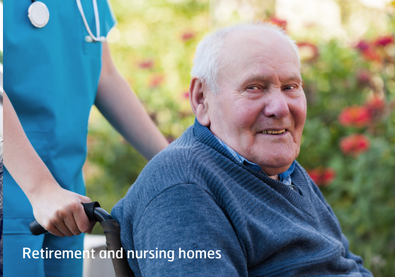
Retirement and nursing homes