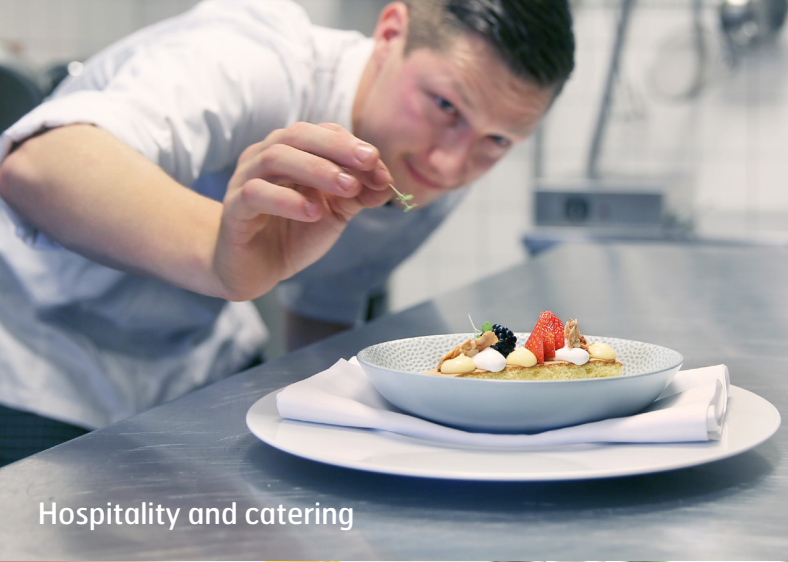
Hospitality and catering